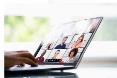
Webinar to learn more about Horizon Europe