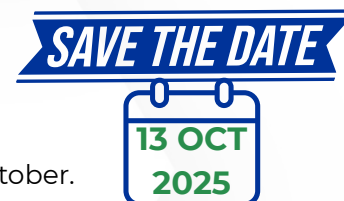
MSCA4Ukraine webinar 2025

Registration: https://web-eur.cvent.com/event/749ad427-f41d-4bfb-9ff9-b218c9c7894a/regProcessStep1